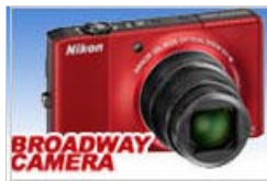
2010 Photo Contest